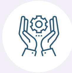
Learning & Development