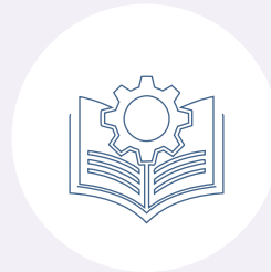
IIIC Industry Institute Interaction Cell