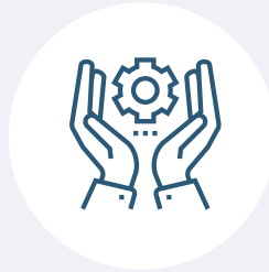
Learning & Development