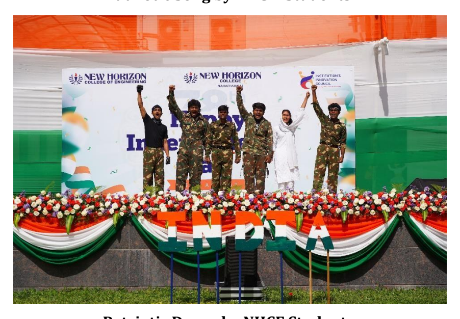
Patriotic Dance by NHCE Students