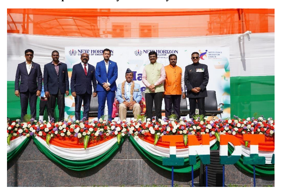
Felicitations to the Chief Guest