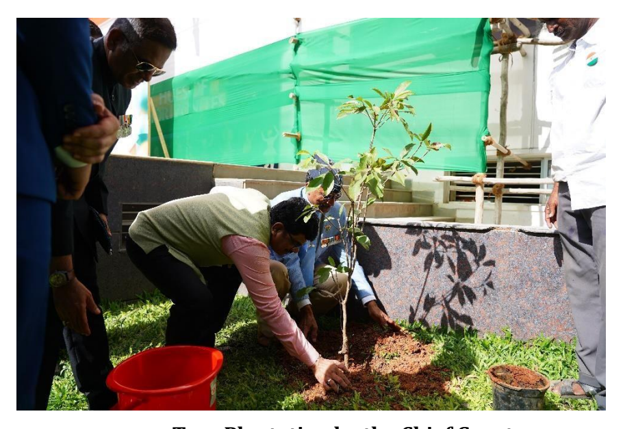
Tree Plantation by the Chief Guest