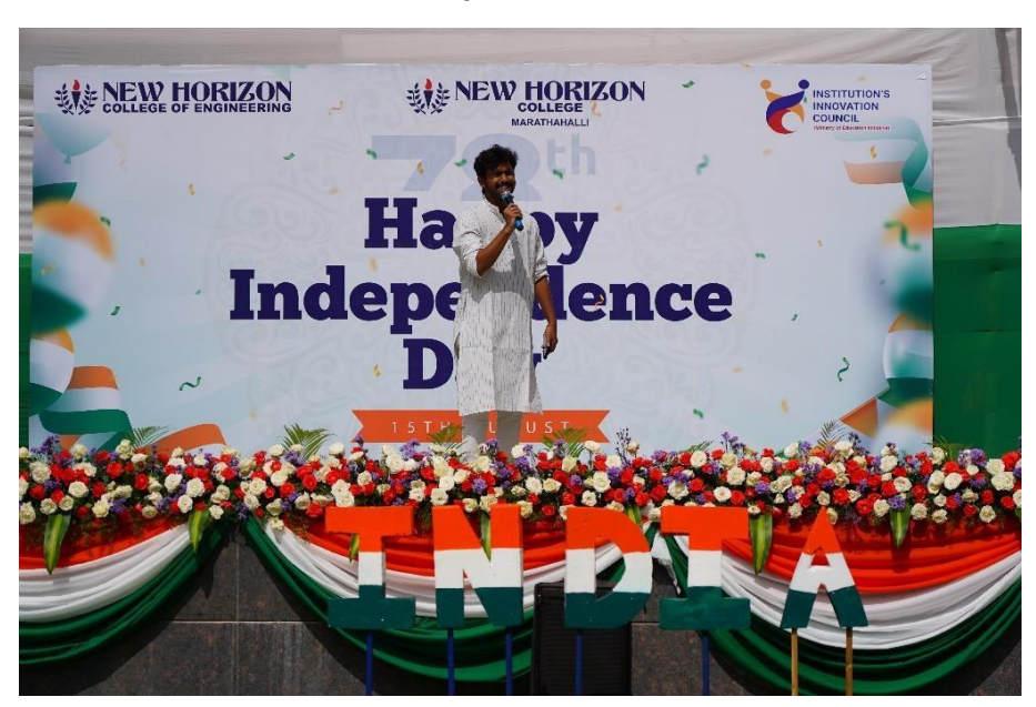
Patriotic Song by NHCM Students