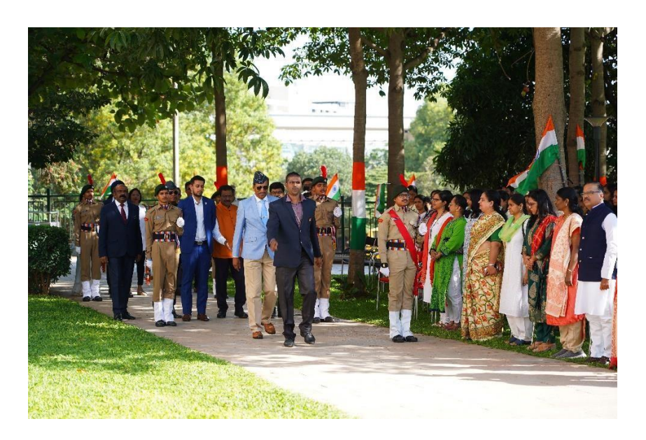
HoD-PED received the Guest near Open Stage