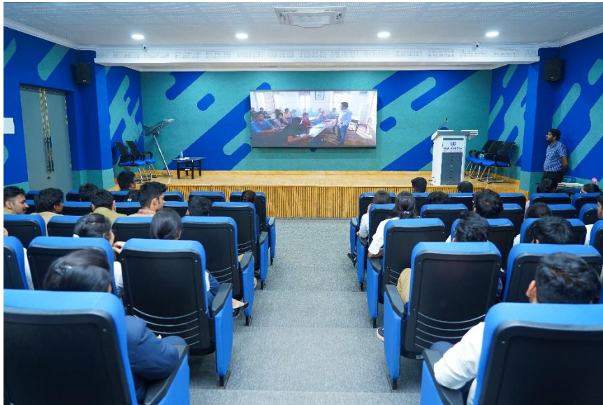
Screening of Documentary on Anti-Ragging