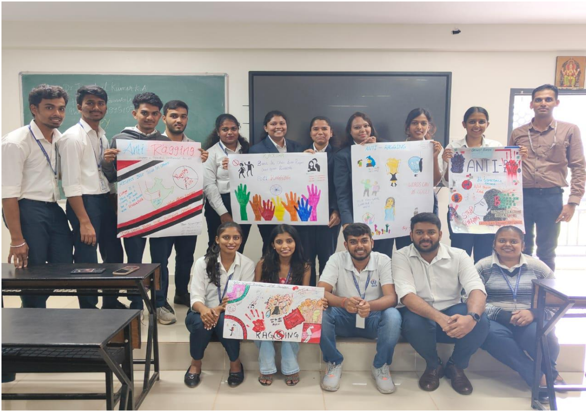
Poster making competition on Anti Ragging week