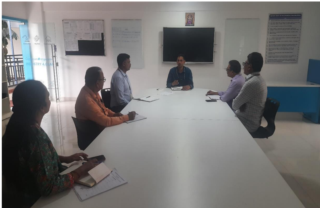
Anti Ragging Awareness Session to the Hostel Wardens