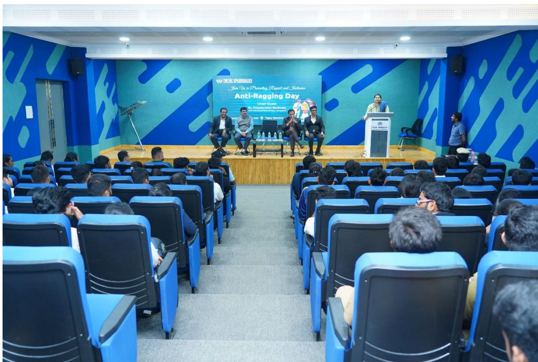
Chief Guest Addressing The Gathering On The Importance Of Eradicating Ragging