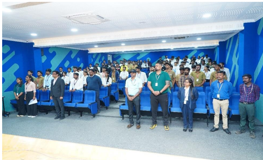
Anti-Ragging Day Pledge By the Participants