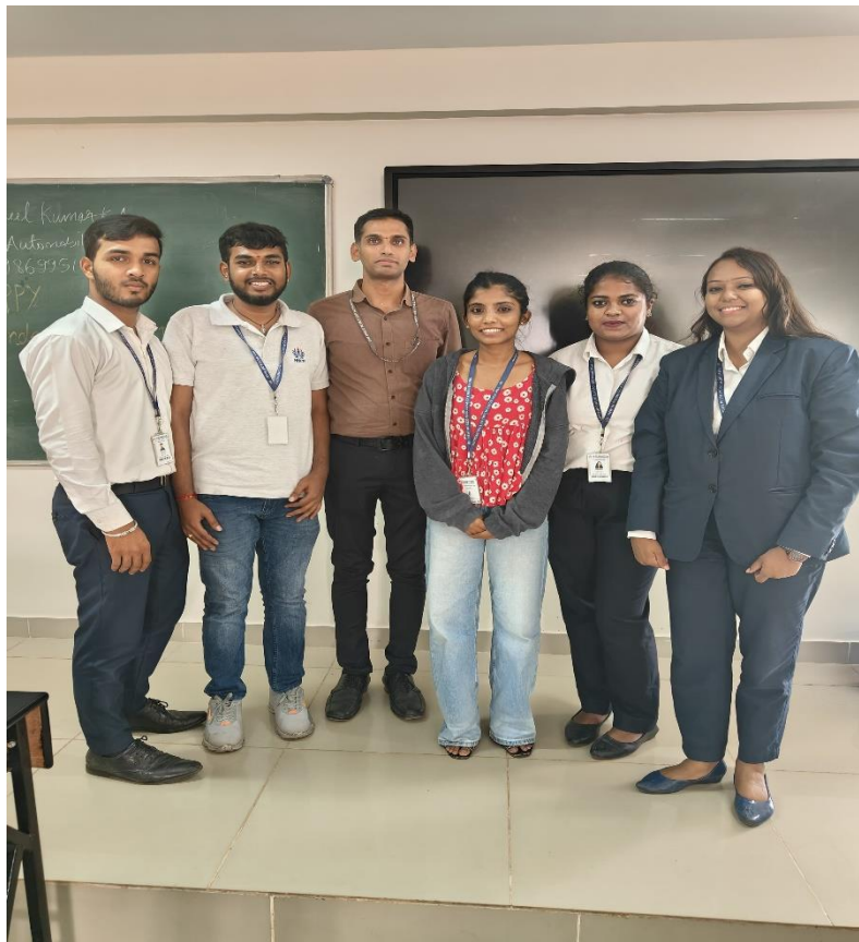
Essay Writing competition on Anti Ragging week