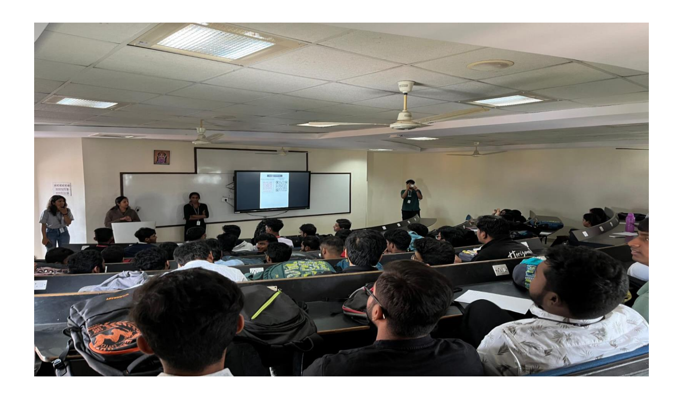
Round 2: Circuit Conquerors: Arduino Workshop and Competition. Students were enlightened on the basics of Arduino and were given a hands-on experience with Arduino projects. A competition based on these basics was then held. The students immersed themselves in the competition and keenly applied their newly gained knowledge. The event concluded on a high note, with thrilling gifts awarded to the winners.

Round 1: Pixel Perfect was a tech image recall challenge. Students were shown numerous pictures of technology and related hardware. They were given some time to view the images and then were tested on their memory. It consisted of 5 levels of varying difficulty. The scores were tallied up and 10 victorious teams were picked. The victorious teams moved on to the next round.