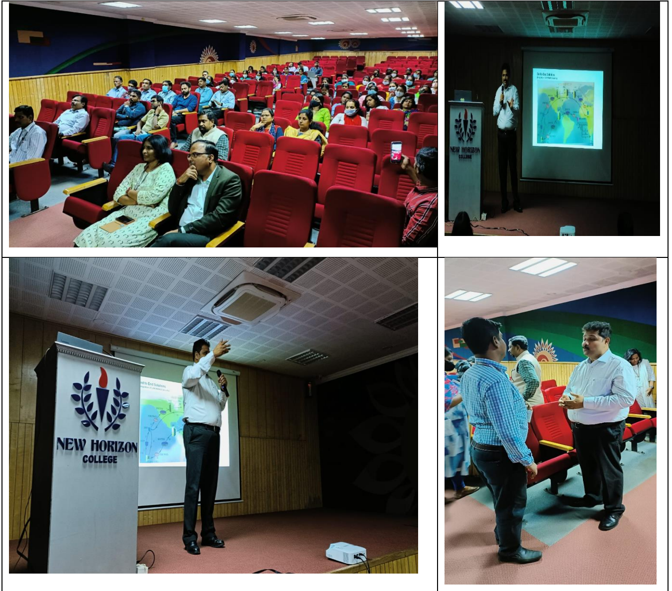
Figure 1: Glimpses of the Event