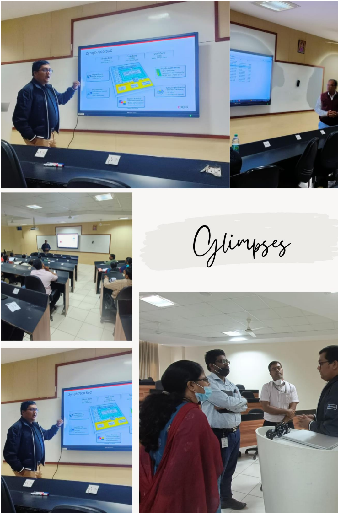
Figure 1: Glimpses of the Event