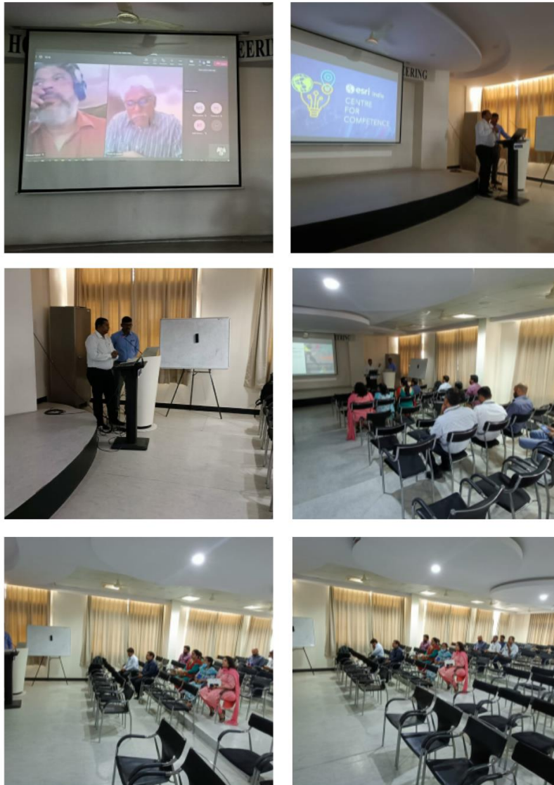
Figure 1: Glimpses of the Event

The faculty interacted with the expert Speaker for clarifications to proceed with research work.