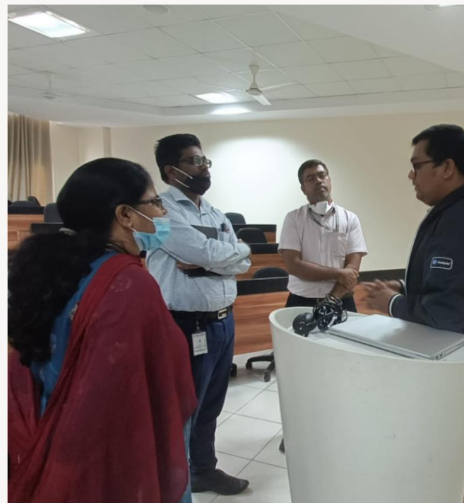
Figure 1: Glimpses of the Event