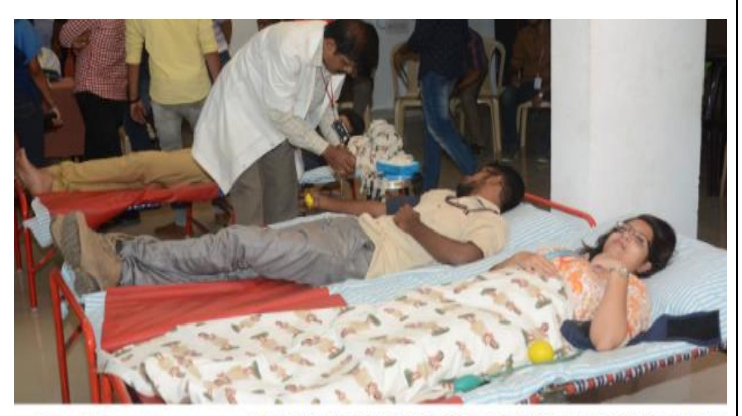
Blood donation camp at NEW HORIZON COLLEGE OF ENGINEERING

The one donating blood was taken to the relaxation room for the rest of a few minutes and given certificates and refreshments. The college assured that the donor card will reach the respective ones in the coming dates.