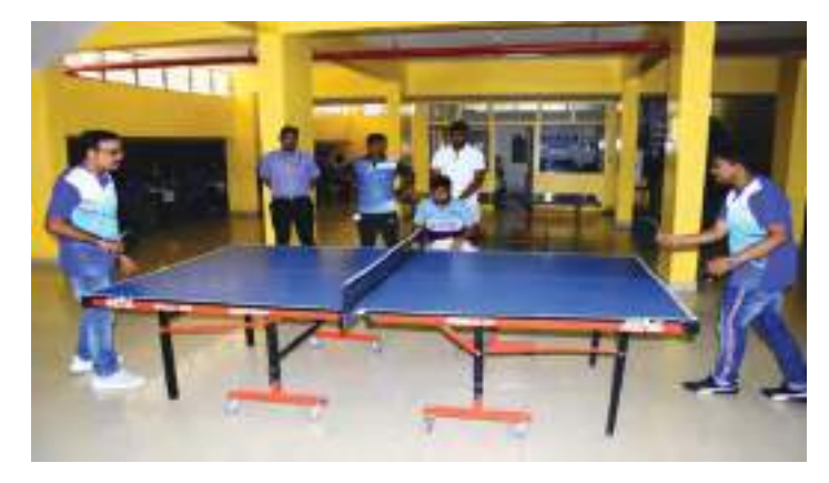
TABLE TENNIS (MEN)