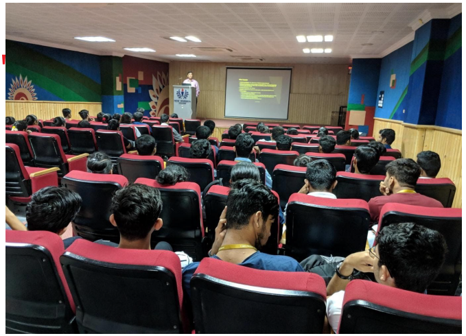
3rd and 7th semester CSE students (24.08.2019)