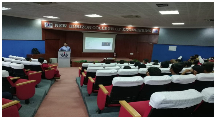
7th semester CSE students (10.08.2019)