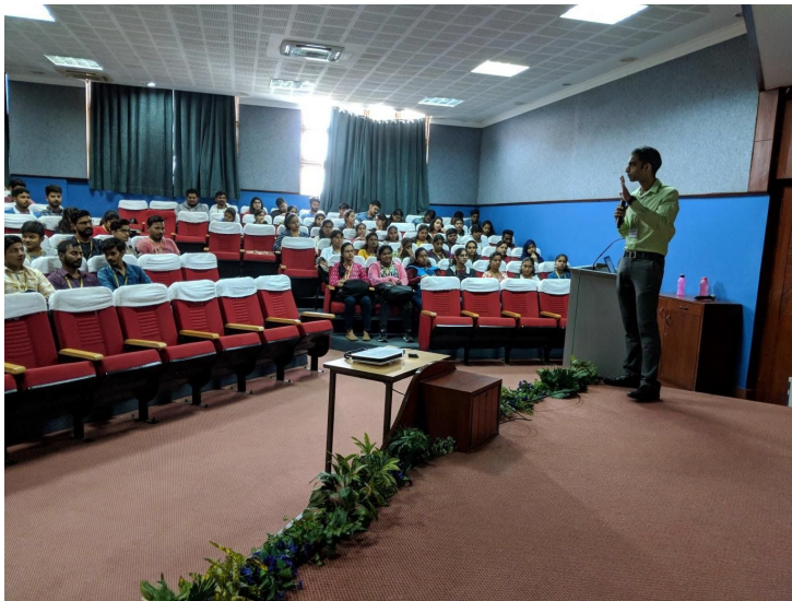
5th semester CSE students (24.08.2019)