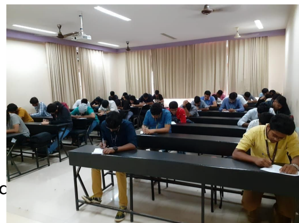
Students of NHCE (23.08.2019)

The event was conducted on 23rd August 2019. The event commenced with the first round at 9:30 AM which consisted of 40 aptitude questions. The first round had 73 participants. The 2nd round commenced after the break and consisted of 24 participants. This round was a code error finding round and consisted of 20 questions. Round 3 had 6 participants and commenced at 2 PM and this was a coding round with 10 questions, each with a problem statement. The whole event was over by 4 PM