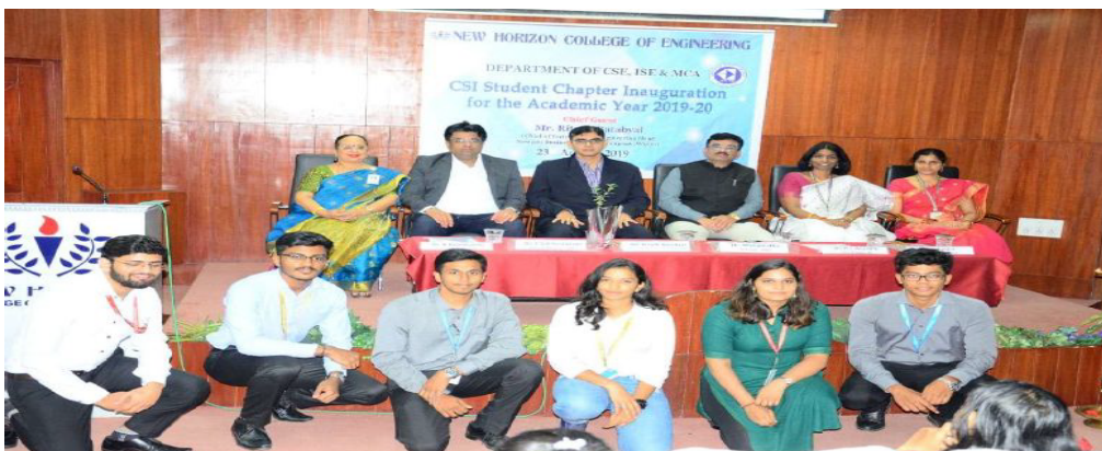
Students of the CSE, ISE and MCA (23.08.2019)