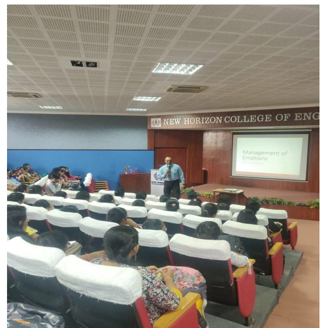
3rd sem CSE students (24.08.2019)