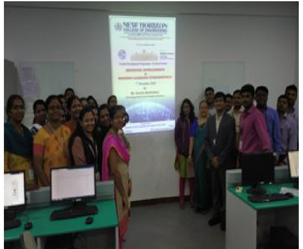
Faculties from CSE, ISE, MCA, ME, ECE (07.12.2018)