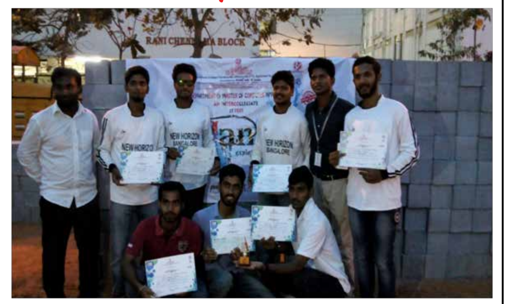
NHC cricket team won the 1st prize in Gully Cricket Tournament conducted by MCA dept NHCE on 3rd April 2017. 43 teams participated for this event.