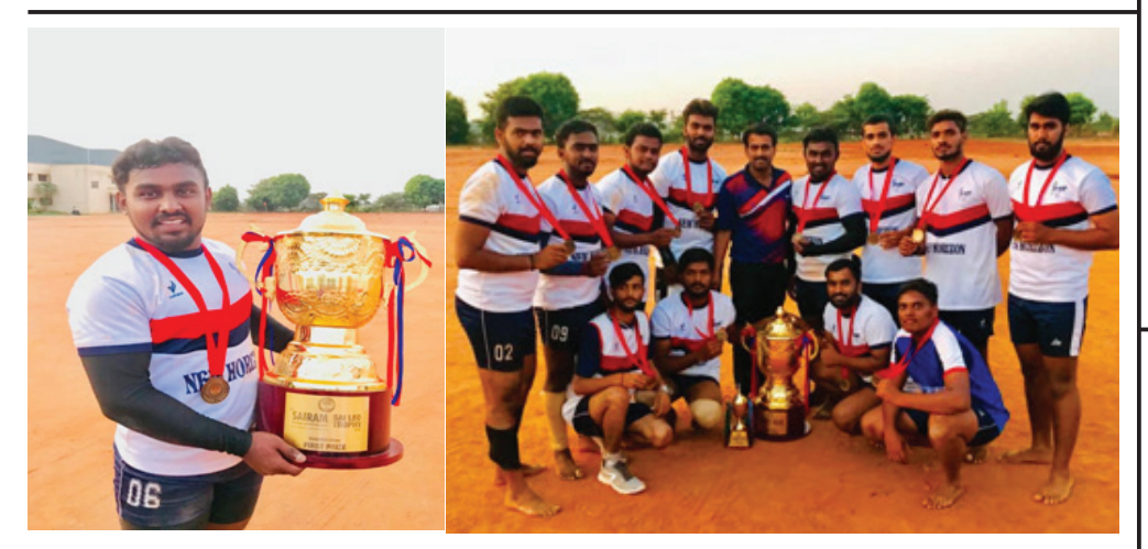
Won SAI LEO Trophy for Kabaddi event organized by SAIRAM college of Engineering

The Girls Throwball team represented the college at the Bangalore North University Intercollegiate Throwball Tournament held at Government Women's College, Kolar on 6th May 2019 and did us proud by bringing home winning the tournament and bring home the trophy for securing the first position.